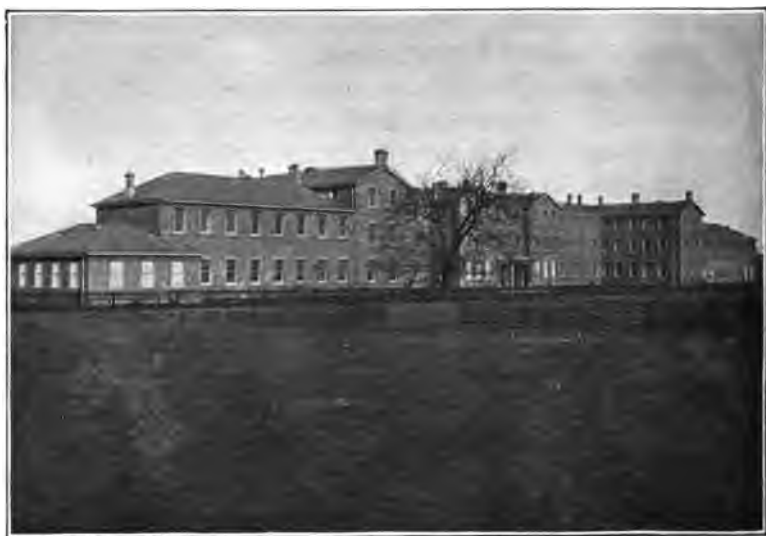
NEW ORPHAN HOUSES, No. 3 AND No. 5.