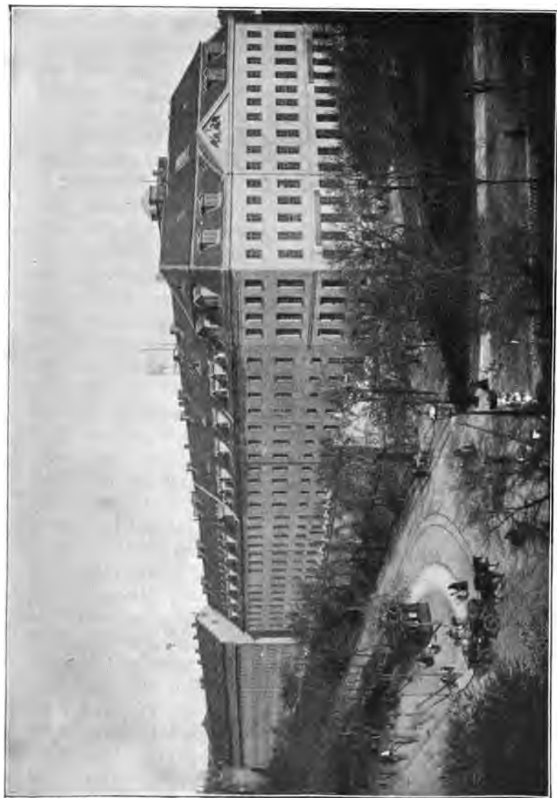
FRANCÉ'S ORPHAN HOUSES, HALLE.