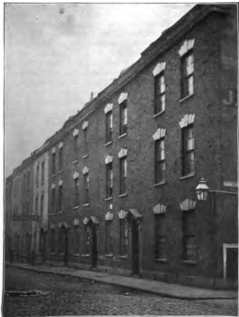
THE FIRST ORPHAN HOUSES (RENTED), BRISTOL.