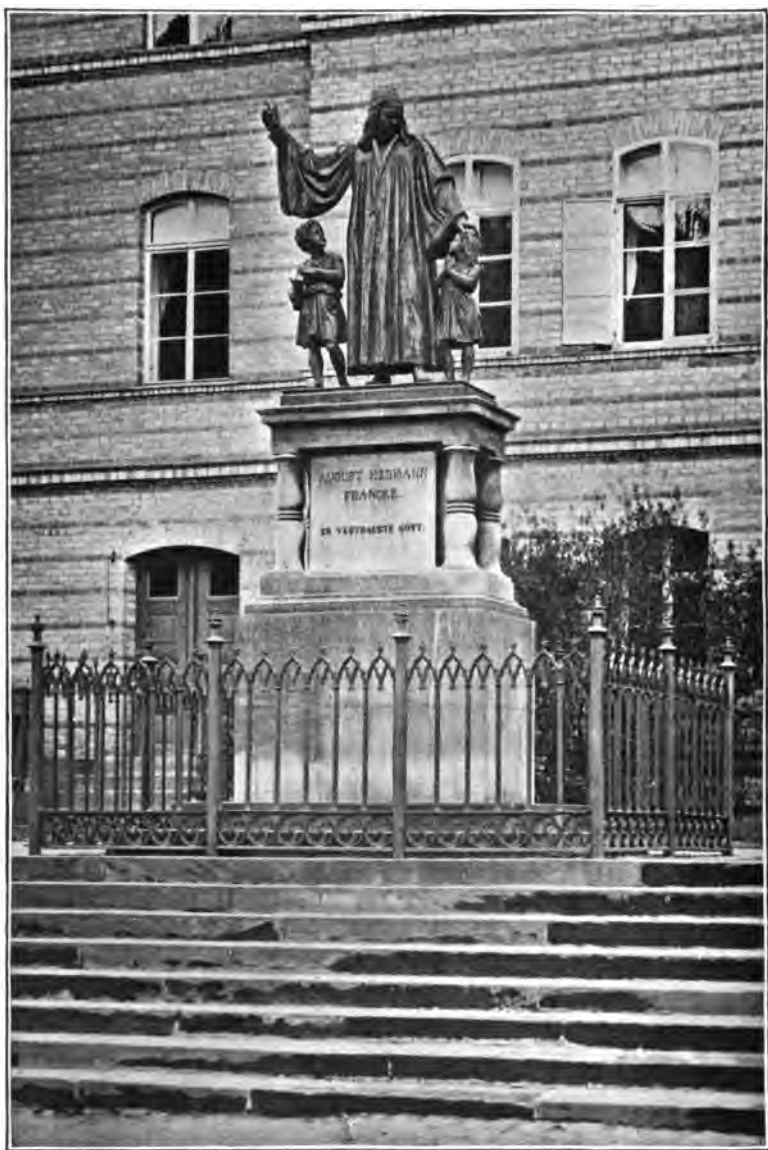
MEMORIAL STATUE OF A. H. FRANCKÉ, HALLE.