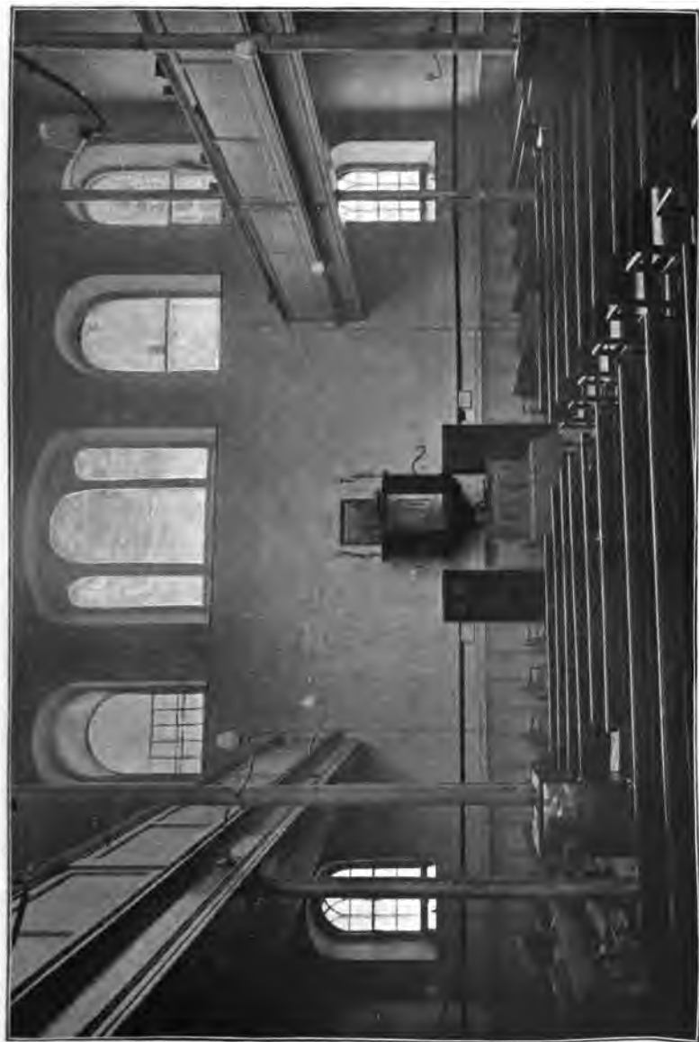
BETHESDA CHAPEL. INTERIOR.