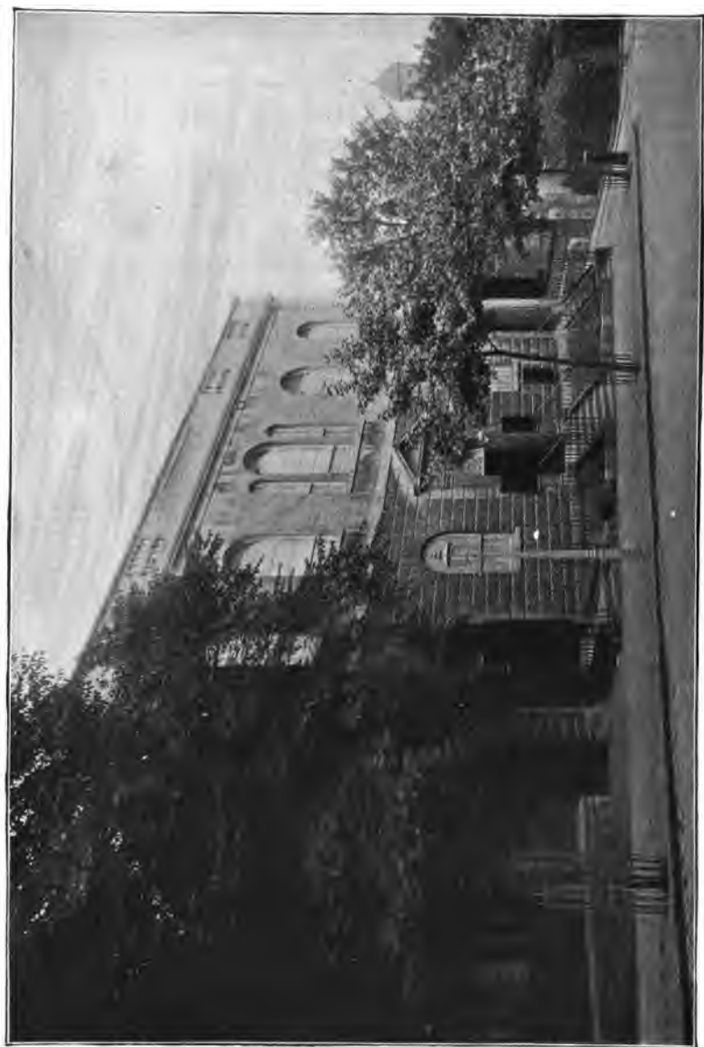
BETHESDA CHAPEL, BRISTOL.