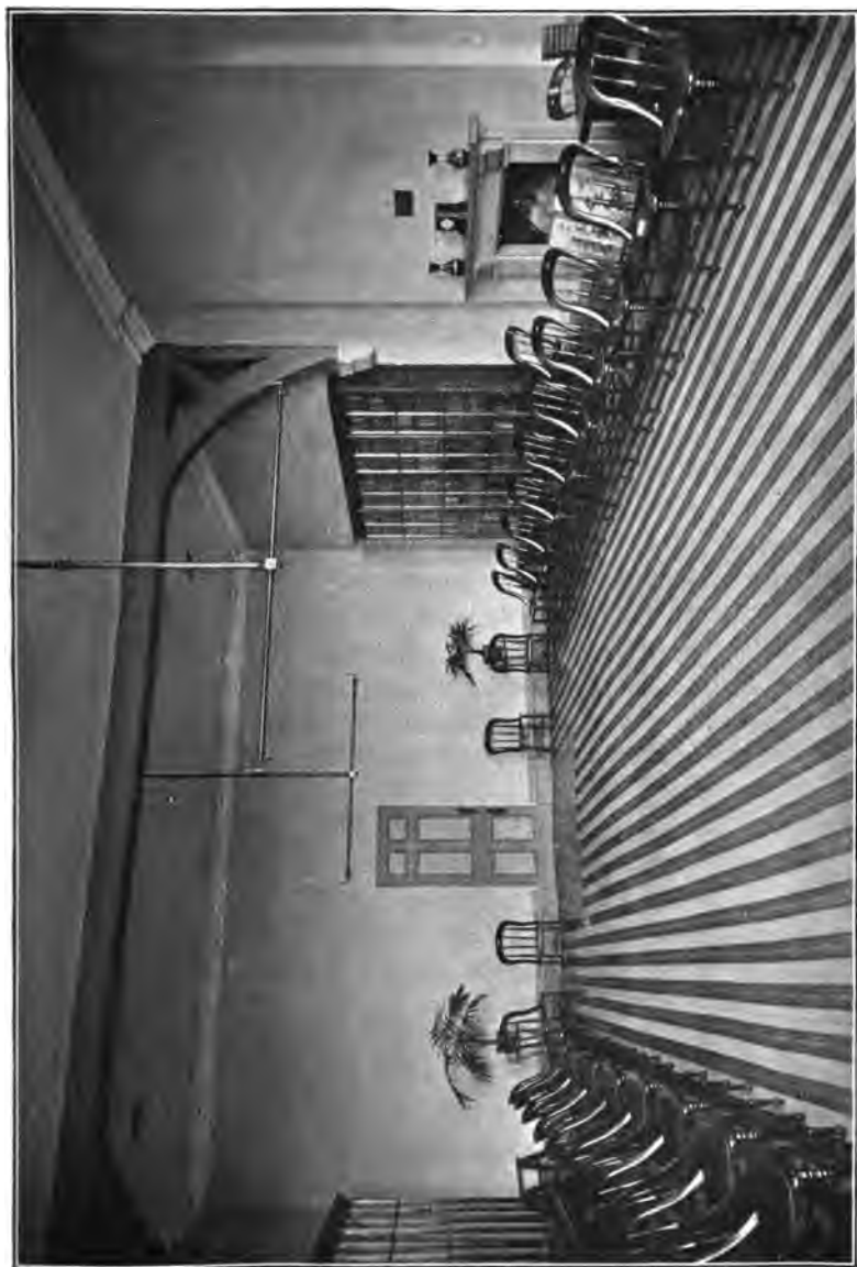
PRAYER ROOM, ORPHAN HOUSE NO. 3.